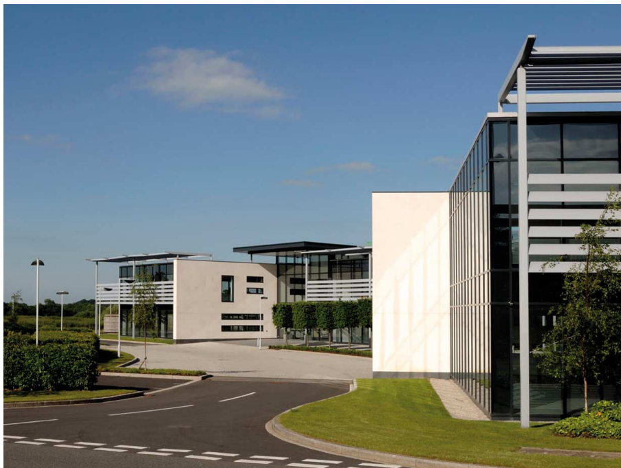
[Figure 2: Vector GB Ltd. in Solihull, Birmingham]