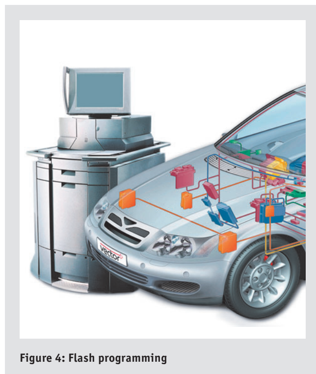
Figure 4: Flash programming

An important topic in reprogramming is the management of different memory types in an ECU. Rising complexity, e.g. in multiprocessor or distributed systems, goes hand in hand with greater memory requirements and the use of different types of memory. Some conventional nonvolatile memory devices have very different physical characteristics. Among the important differentiating characteristics of nonvolatile