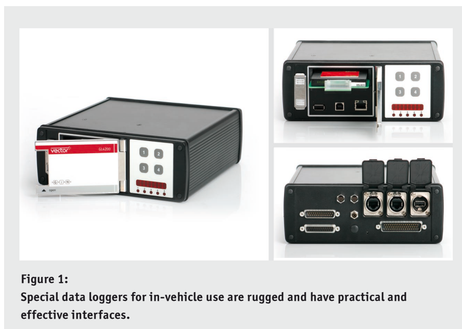
Figure 1: Special data loggers for in-vehicle use are rugged and have practical and effective interfaces.

The data of each classing task is saved in text-based results tables that can easily be read into a program such as MS® Excel for post-editing.